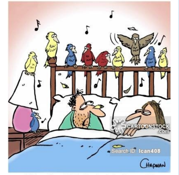
"Okay fine, I'll fix the hole in the roof."

If you have a member in mind to spotlight, contact info@tarcroof.com